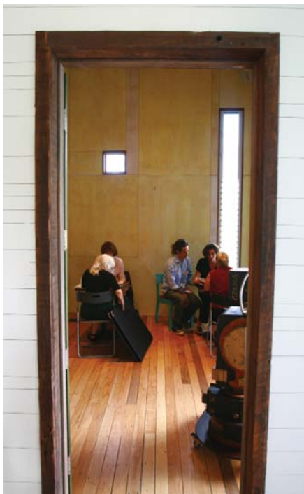
Doorway to dating.