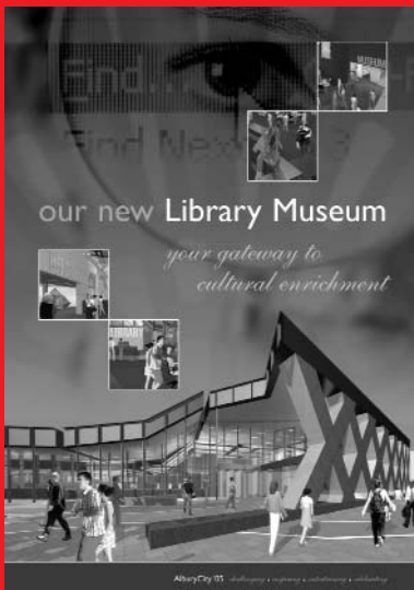
Left and below: Front page and drawing from the brochure for the new fully integrated library and museum in Albury, an ambitious project, 10 years in development, which aims to redefine the cultural experience for its community when it opens in 2007 – borrow a book, view an exhibition, learn about ‘our story’, use the latest technology, all in the one civic building designed along ESD principles.

These and other questions need to be answered before we can be confident that the substantial investments being made in cultural capital infrastructure is going in to the right places, for the right people, for the right reasons. ■