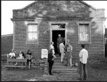
L-R: 'Cinema' in Hill End; Under construction: The new Dubbo Cultural Centre on the old Dubbo High School site, which will open in September; The Crossing Theatre, Narrabri.