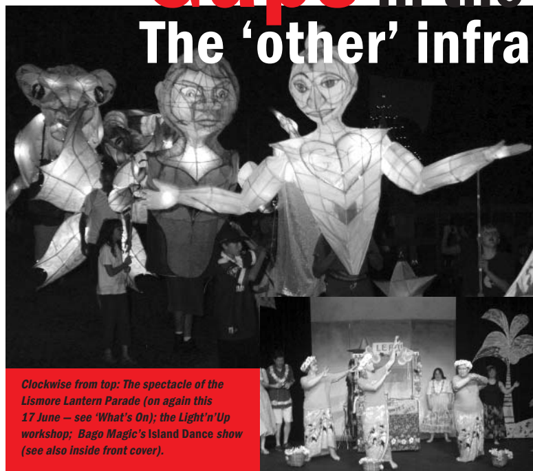
Clockwise from top: The spectacle of the Lismore Lantern Parade (on again this 17 June – see 'What's On'); the Light'n'Up workshop; Bago Magic's Island Dance show (see also inside front cover).

developed over a longer period of time and involving the employment of skilled artists.