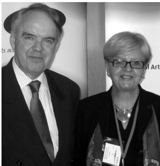
Minister for the Arts & Sport, Senator Rod Kemp, with the President of Regional Arts Australia (and Chair of Regional Arts NSW), Meg Larkin, at the Summit in Canberra, 10 August 2006.

Instigated by Regional Arts Australia and hosted by the Minister at Parliament House, the 2006 Regional Arts Summit consisted of a facilitated panel discussion amongst 25 diverse representatives of regional arts practice, decision-makers and business leaders from around the country. The discussion took place before an audience of approximately sixty stakeholders from across Australia, who also had input into the proceedings.